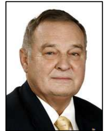
Bo Bladholm © Yanan Li

Bo Bladholm, Lord Mayor, City of Stockholm, said: "On behalf of the City of Stockholm, I would like to invite risk managers of all nationalities to attend the FERMA Risk Management Forum in 2011.